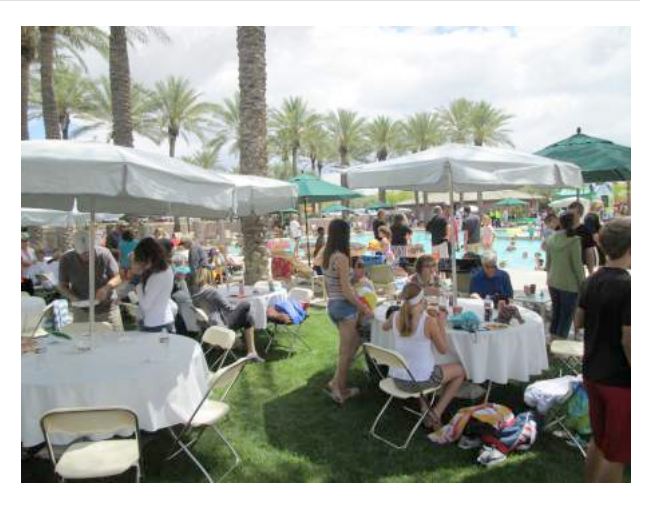
2015 Spring Fling