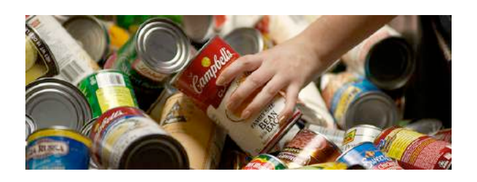
2015 Food Drive