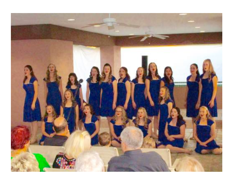
2015 Adult Holiday Party