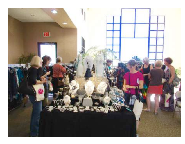
2015 Gift Fair 2015