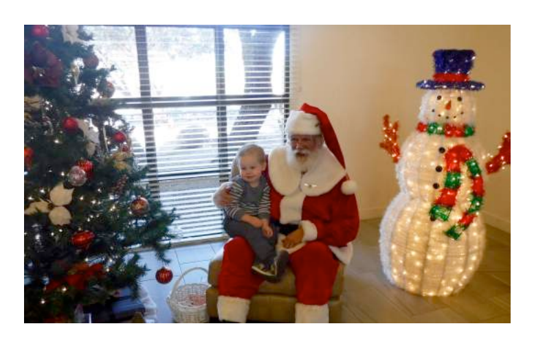
2017 Children's Holiday Party