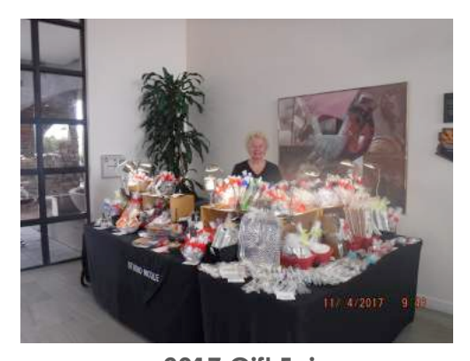
2017 Gift Fair